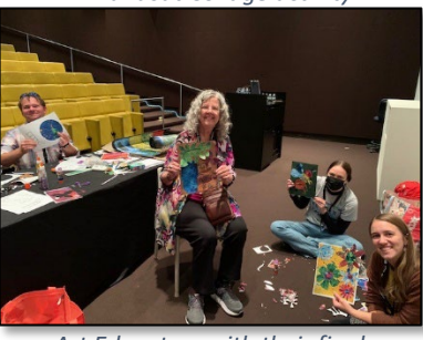
Art Educators with their final NASA Landsat Collages

October 2022 – Art Educators: lowaView staff presented a session, "Discovering Earth as Art," at the Art Educators of Iowa Fall Conference. The presentation invited art educators to "explore and engage with earth science and satellite images as we make a little STEAM". After the presentation, educators were encouraged to participate in a hands-on, Landsat Collage activity: <a href="https://landsat.gsfc.nasa.gov/outreach/landsat-home/landsat-collage/">https://landsat.gsfc.nasa.gov/outreach/landsat-home/landsat-collage/</a>.