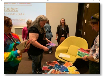
Art Educators beginning the NASA Landsat Collage activity

GIS Day 2022 – Celebrating 50 years of Landsat & 30 years of the ISU GIS Facility 11/16/22 was a day to raise awareness about various GIS opportunities on campus, celebrate 30 years of the ISU GIS Facility, and 50 years of the Landsat satellite mission. Over 100 visitors stopped by our table in the ISU College of Design lobby, receiving information about the undergraduate minor in GIS and graduate GIS certificate. The GIS Facility provided cupcakes, cookies, coffee, posters, trading cards and map puzzles for assembly.