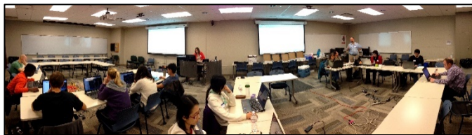
Top left: An image from an event in July 2015 at the Iowa 4-H youth summer conference, "Dare to Discover." Top Right: View over a participant's shoulder at the MLK Jr. Day of Service, January 2015. Bottom Image: Afternoon session of MLK Jr. Service Day event, January 2015.