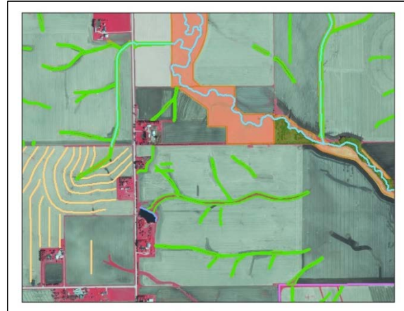
An example of the conservation practices being collected: grassed waterways (neon green), terraces (yellow), grassed riparian area (orange), forested riparian area (dark green); base photo is color infrared.

There is a critical need for the development of tools and data to inventory nutrient management practices in the upper Midwest. Many corn-belt states have been required by the US EPA to develop nutrient reduction plans to reduce the amount of agricultural fertilizers reaching the Gulf of Mexico via the Mississippi River Basin. The Iowa Nutrient Research Center at Iowa State University funds a project to develop technologies to inventory and monitor conservation practices that could potentially meet nutrient reduction targets for watersheds. The Iowa Department of Natural Resources also funds a related project inventorying an expanded set of conservation practices. IowaView staff are coordinating portions of both projects at the ISU GIS Facility and funding part of a student's time to digitize practices using aerial imagery and elevation data.