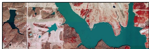
2009 spring color infrared (CIR) imagery, Three Mile Lake, Union County Iowa. CIR highlights differences in growing vegetation versus water and bare ground.