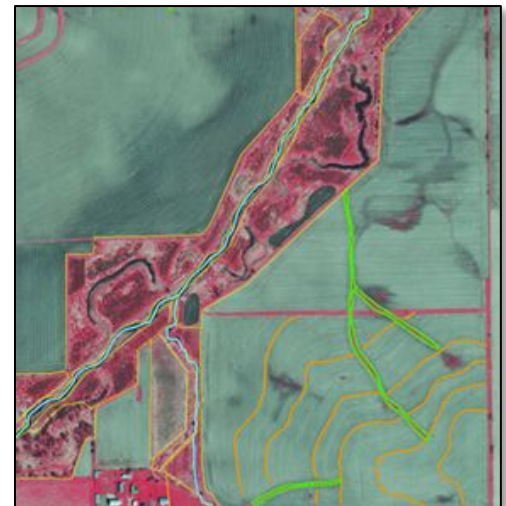
Benton County, 2010 0.6 meter spring color infrared aerial imagery showing riparian area along a stream, terraces and grassed waterways.

This project had another component that developed a semi-automated method to identify and classify the non-crop riparian land bordering main stream