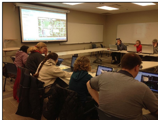
MapGive event for MLK Jr Day of Service on Iowa State University campus at the GIS Facility. Staff, students and general public attended the event that created new data from aerial imagery for Ogden, Iowa and Ruang, Indonesia.