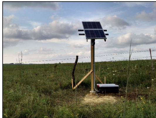
Grand River Grasslands, Ringgold County IA. Installed phenocam with solar panel and battery.