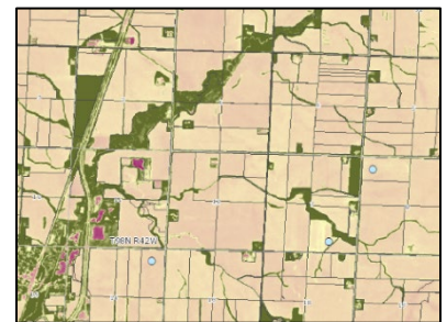
NDVI Late Spring Image Osceola County, Iowa - 5/25/2018

IowaView is a member of the AmericaView Consortium, a nationally coordinated network of academic, agency, non-profit, and industry partners and cooperators that share the vision of promoting and supporting the use of remote sensing data and technology within each state. AmericaView is funded by USGS grant agreement G18AP00077.