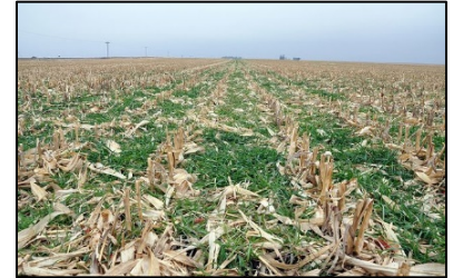
Cereal Rye Cover Crop Field

The final step of the tool reclassified the composite image to three categories based on the sequence of NDVI values: No Cover Crop, Potential Cover Crop, and Cover Crop. These raster values were then summarized by field boundary to give a generalized indication of cover crop potential in the field.