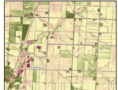
NDVI Early Spring Image Osceola County, Iowa - 4/25/2018