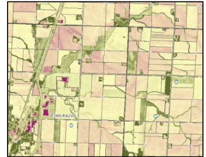
NDVI Fall Image Osceola County, Iowa - 11/21/2017